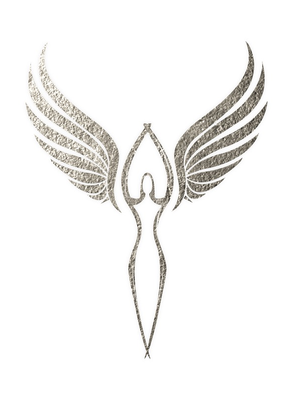
BELLA GRACE REWARDS PLAN